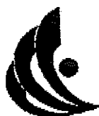
Floyd Memorial Hospital and Health Services