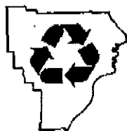
Floyd County Solid Waste District